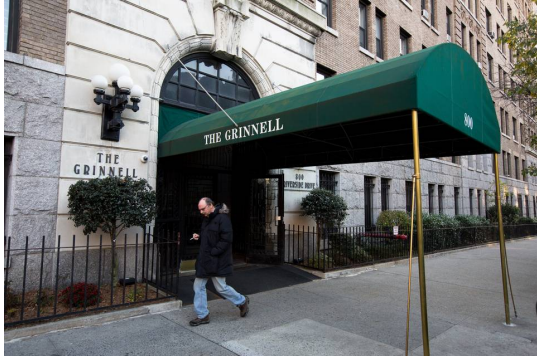
The Grinnell, a limited-income co-op at 800 Riverside Drive.

The buildings, many badly mismanaged, would come under tighter rules in return